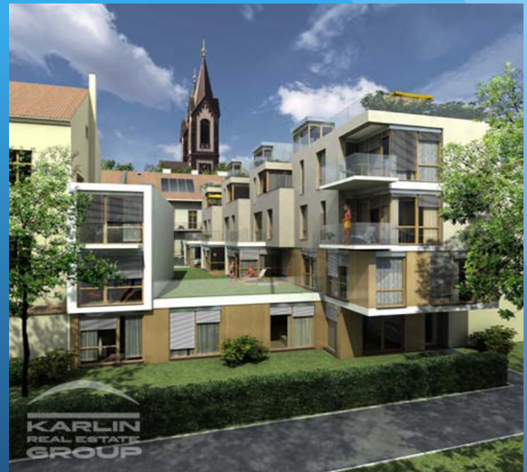
Social Housing Karlin, Praha CR Architect: Safer – Hajek Architects