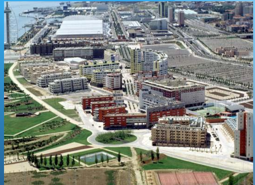
1998 Expo Site, Lisbon

Declaration of Interdependence for a Sustainable Future, Chicago, 1993