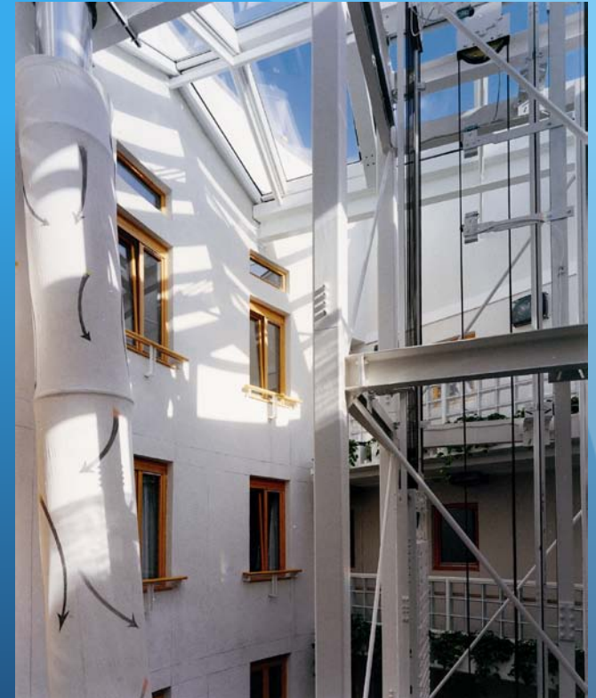
Green Building, Temple Bar, Dublin Architect: Murray O'Laire