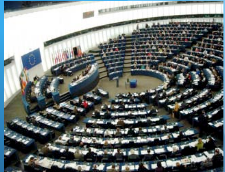
Main Chamber - European Parliament - Strasbourg Architecture Studio Europe, Architects