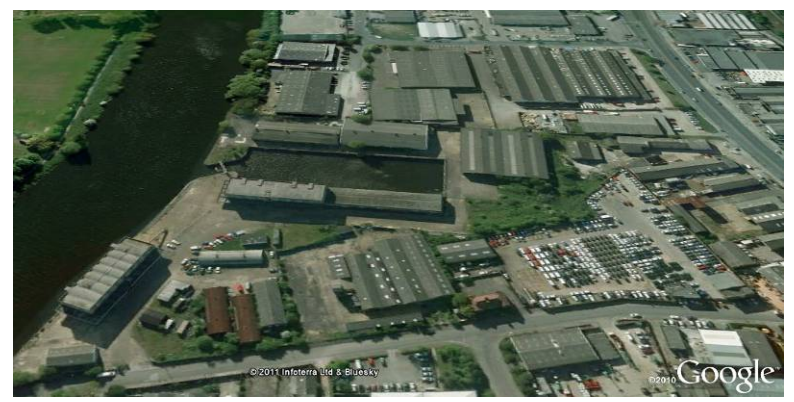
Proposed site -air view 2

The subject of the competition is the design of a regeneration proposal and the creation of a sustainable neighborhood within this area. This should provide 12-15 accommodation for families. plus infrastructure. office areas, leisure and recreation, as part of the regeneration program, which is based on a new paradigm for post-industrial sustainable regeneration.